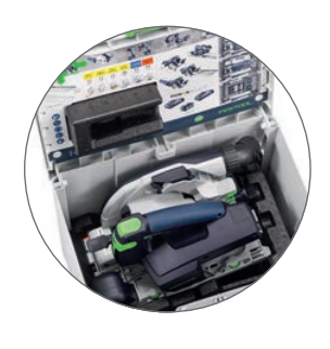
YOUR SOLUTION Customised, individual or extraordinary

Packaging, organising, presenting, transporting: The systainer® from TANOS offers the perfect storage solution for your product. Variable compartment separator sets, dividers and fixable insert boxes ensure that small parts are clearly organised, while perfectly fitting base and lid inserts provide reliable, non-slip storage for tools, sensitive equipment or larger supplies.